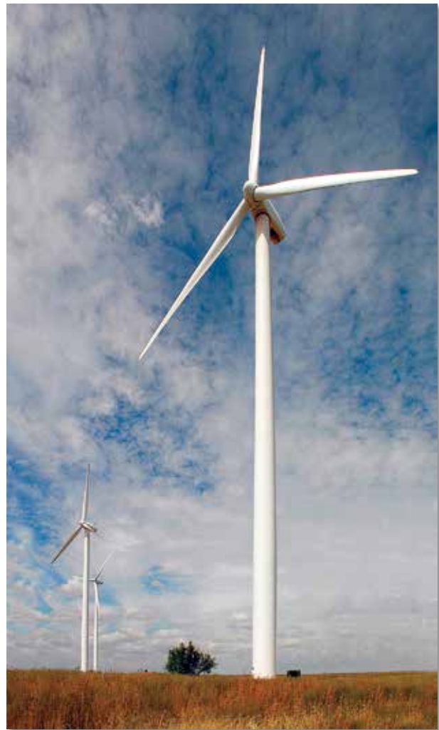
When finished next year, the PREP wind turbines will be located just south of these privately owned turbines already in service near Pantex.