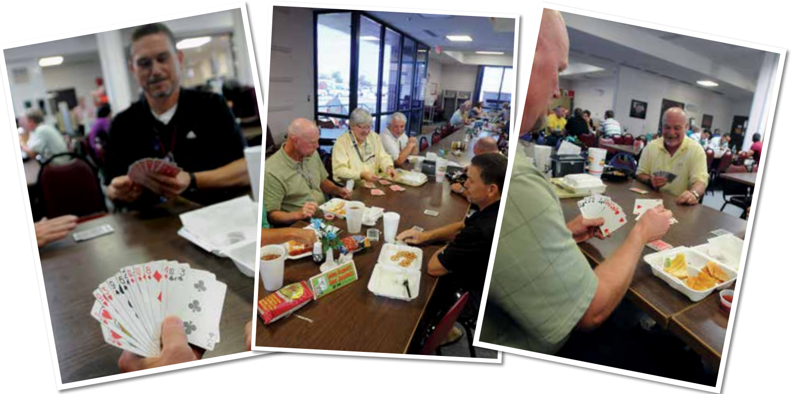
Pantexans uphold a tradition that began in the late 1970s as they play Spades during lunchtime in one of the Plant's cafeterias.