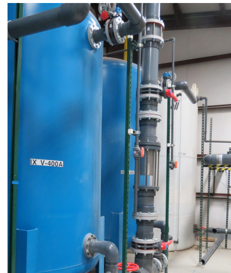
Ion Exchange and Effluent Tanks at SEPTS

The Southeast Pump and Treat System (SEPTS) has been operating since 1995 when it started as a