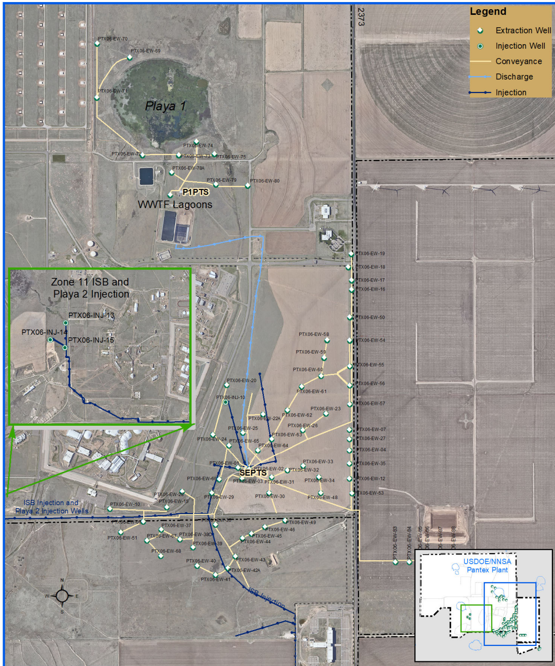
SEPTS and PIPTS Wellfield

It is expected to take several years of extracting water to fully affect the perched groundwater gradients in the southeastern area of the plume, thereby reducing movement of high explosives and other chemicals to the southeast. This action is one of several positive steps Pantex is taking to protect the Ogallala Aquifer.